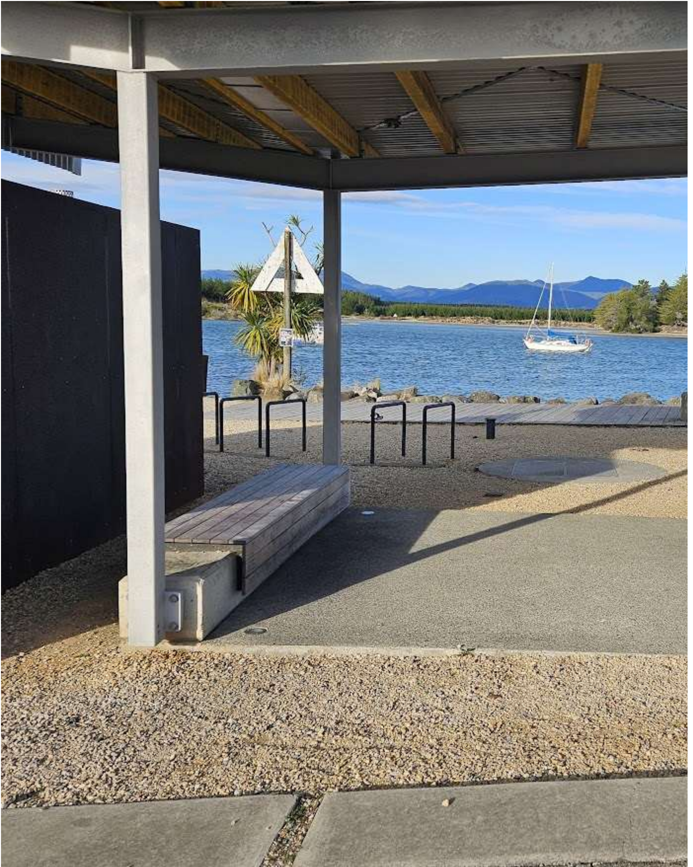
Site 3: Near round-a-bout opposite Delicious