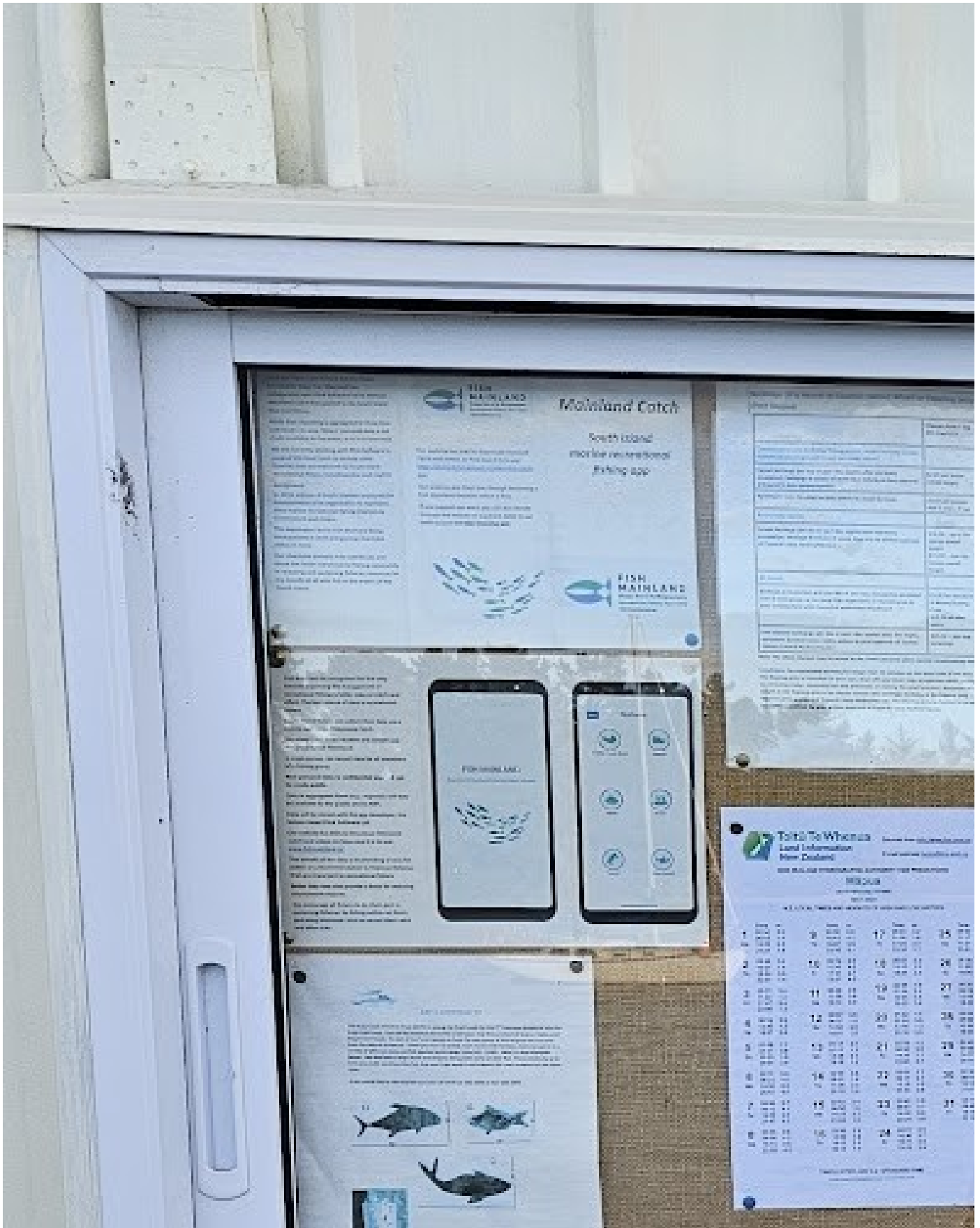
Site 1: Within retail area at end of Planter Box