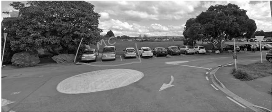
Iwa Street - One side of 'No Parking' in between parking bays (already consulted on) - no other changes to be made at this point to Iwa Street.