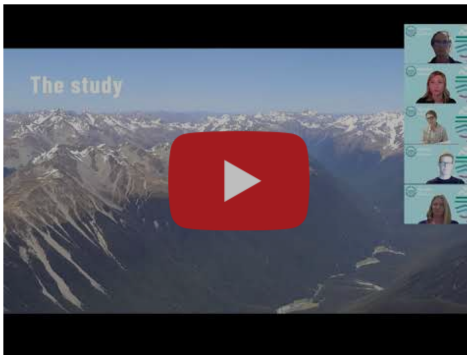
Tasman Landscapes and Coastal Environment Project Webinar Recording